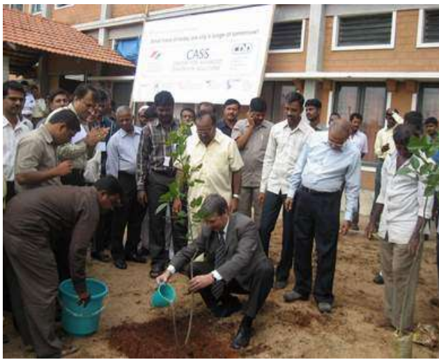
Pic: CDD celebrates World Environment Day through 'Honge' Plantation at CASS on World Environment Day - 5 th June 2009