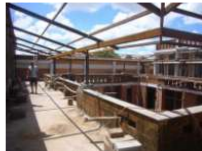
Pic 2: Exhibition Unit at CASS