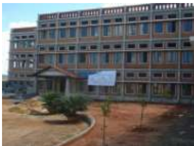
Pic1: CASS centre at Kengeri

The other components are Exhibition Unit, a Library Unit, a Research and Development Unit and a Production Unit for prototypes and small prefabricated elements of DEWATS.